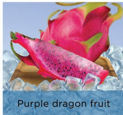
Purple dragon fruit