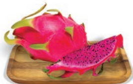
Purple dragon fruit